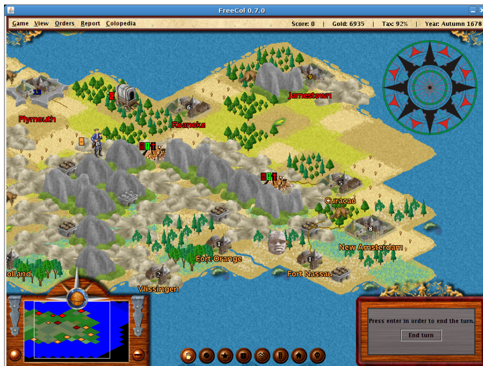
Figure 1: The main screen.

The figure 1 represents the main screen.